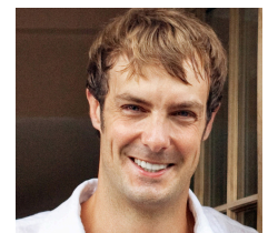
Barton Seaver, chef & author • FOOD & HEALTH • SUSTAINABLE COMMUNITIES