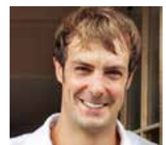
Barton Seaver, chef & author • FOOD & HEALTH • SUSTAINABLE COMMUNITIES